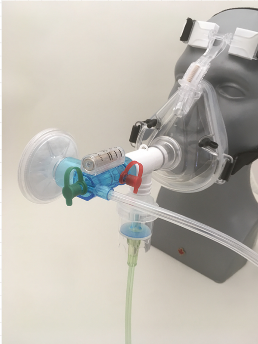
8800 shown with nebulizer kit attached